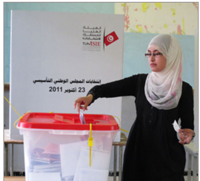
Tunisian woman casting her vote in the Tunisian election

Through the regional project, "Parliaments and crisis prevention," the UNDP opened a summer university that enables women in politics to train other potential female candidates in the preparing and running of electoral campaigns. Participants are trained by national and international experts in how to overcome