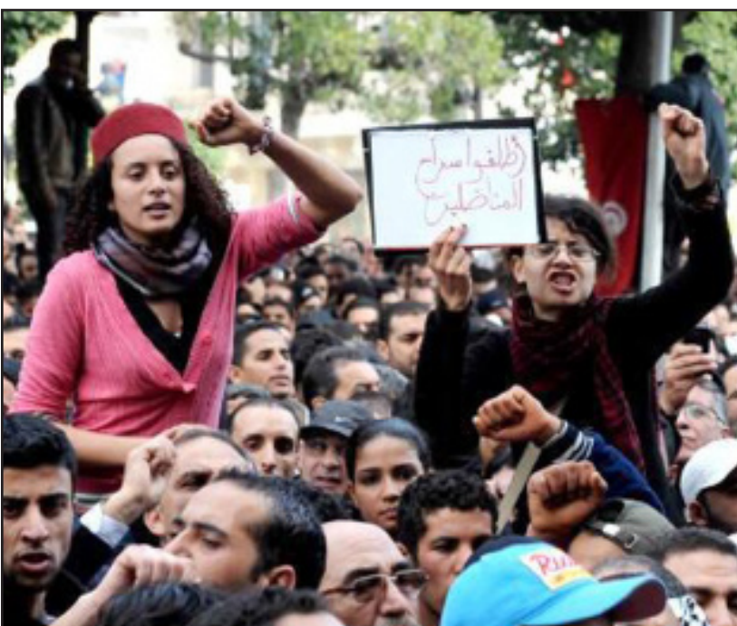
Tunisian women demonstrating, wearing a hat, which is normally worn by men only.

Technical support for women interested in pursuing a political career or running electoral campaigns should be increased and begin as early as possible to avoid the hurriedness that many women candidates experienced during recent elections in Tunisia. In addition to this, political parties need to review their internal regulations to improve gender equality, women's access to decision-making within the parties, and guidelines for equal representation within the political parties themselves. As for the role of the Egyptian media, it should provide more space for public discussions on the role of women in politics and analyse experiences from other countries where women have had leading roles in democratic transitions, as well as helping Egyptian women learn specific media skills.