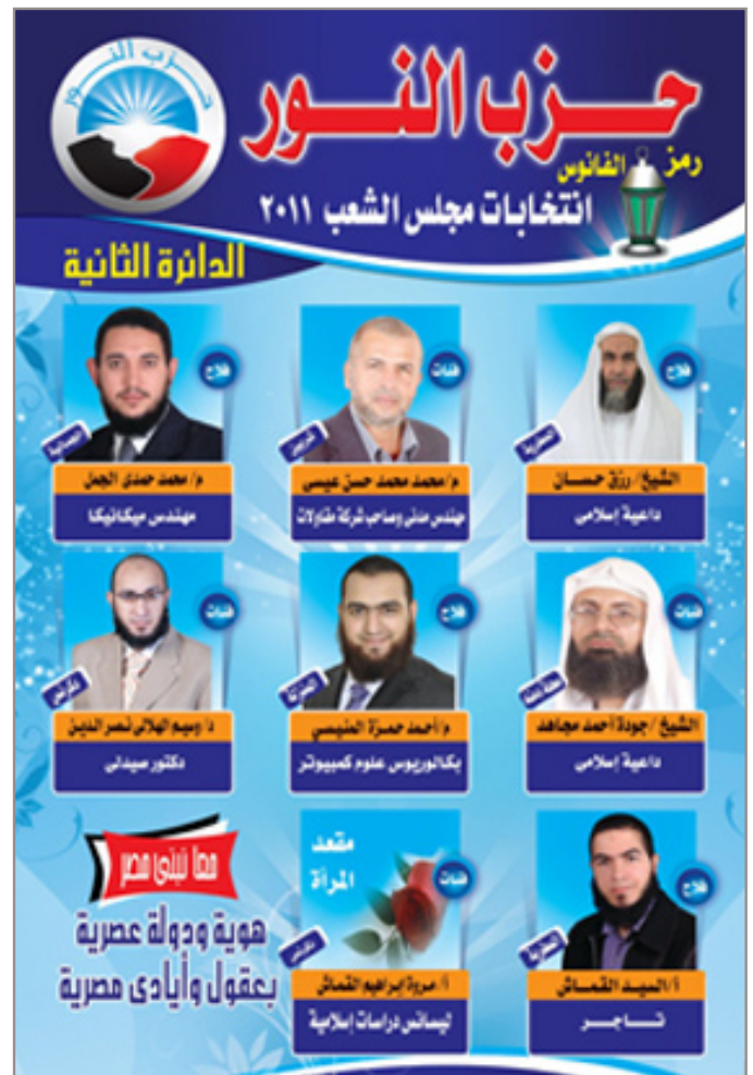
This election poster carries a picture of a flower instead of a woman

Women can still play an influential role in Egyptian politics, as exemplified by the female candidate who won a seat in Upper Egypt recently. Egyptian women are important political actors, but conservative forces continuously try and minimise the political participation of women. In response to this, groups of international Muslim feminists, such as "Sisters in Islam" (Musawah), are reinterpreting the Koran, seeking to reconstruct the idea of women and their role in politics. Egyptian women still need to bridge the gap between religious and secular women's groups, however, just as more Egyptian women need to be mobilised from civil society in general.