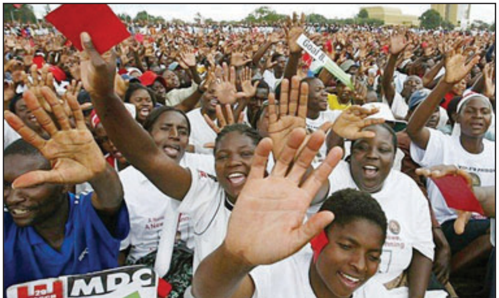
Rally for the Zimbabwean opposition party Movement for Democratic Change, March 2011

The NCA sees as its main goal a new Zimbabwean, people-driven and democratic constitution, which will ensure gender equality within the political institutions. Women play a key role in the achievement of this goal, and the NCA subsequently believes that without their involvement the democratisation process will not be a successful one.