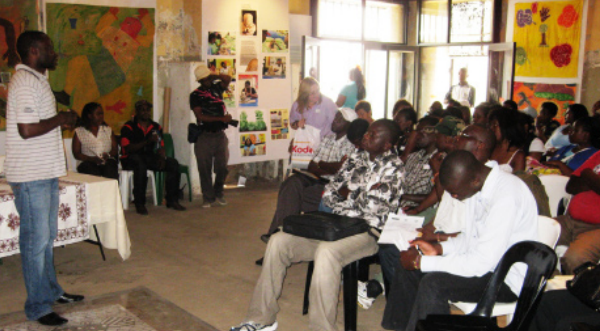
Launch of the campaign “ACT NOW Against Political Violence, Torture and Rape in Johannesburg, December 2010